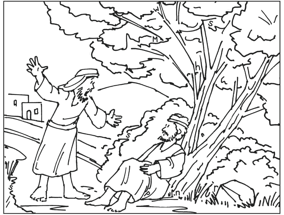
St. Patrick Parish Children's Bulletin

Find the underlined letters hidden in the picture below. “We have found the One M oses wrote about in the L aw, and about Whom the p rophets also wrote – J esus of N azareth, the S on of J oseph.”